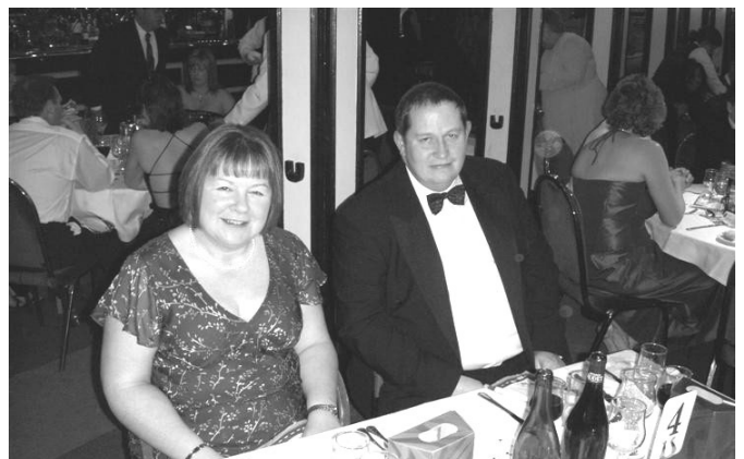
Some photos from the Dinner & Dance